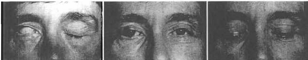
FIG. 2. Testing for the proper size of gold weight in a 47-year-old stenographer, 5 months following a resection of an eighth nerve tumor with destruction of her facial nerve. (left) Position of her lids during closure, one day following the division of a protective tarsorrhaphy. This demonstrates absence of orbicularis function. The extreme elevation of her upper lid probably results from adhesions between the superior rectus muscle and the levator, associated with Bell's phenomenon causing the superior rectus to rotate the globe upward on closure. (center, right) Functional alteration occurring with a 1.4 gm gold prosthesis glued to her eyelid (with dermatome glue), while she is looking forward and down.

By blunt dissection, the plane is opened to make room for the prosthesis on the surface of the orbital septum and the tarsal plate. The prosthesis will usually rest most comfortably with its lower edge a few millimeters above the lid margin. The prosthesis is tied to the orbital septum with a single 5-0 or 6-0 nonabsorbable suture, to hold it in place until the tissues heal around it.